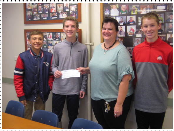
St. Joe 8th graders at the Parish Kitchen