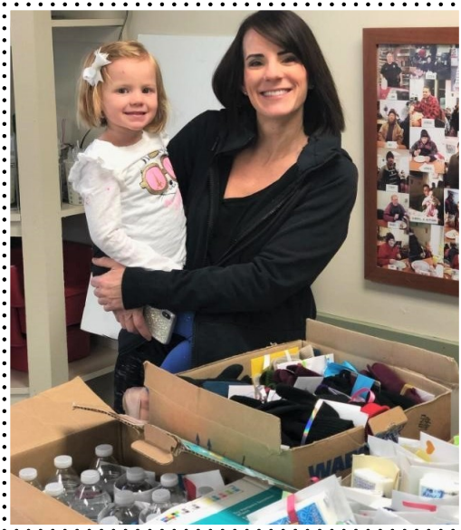
St. Pius donations